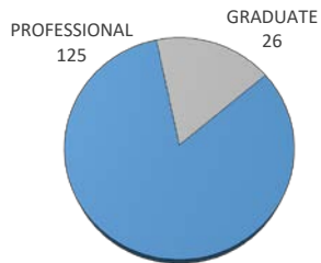
CREDIT HOURS ENROLLMENT BY CLASSIFICATION